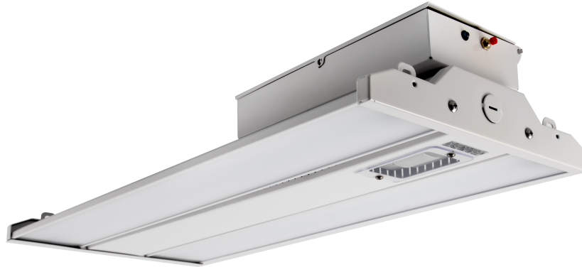
Photo shows optional lens, occupancy sensor and EM kit